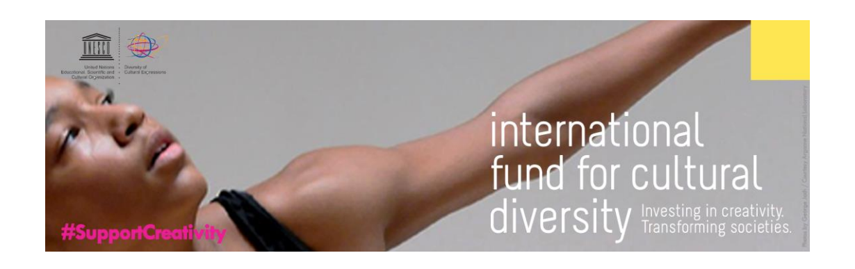
Annex 1: IFCD Results Framework